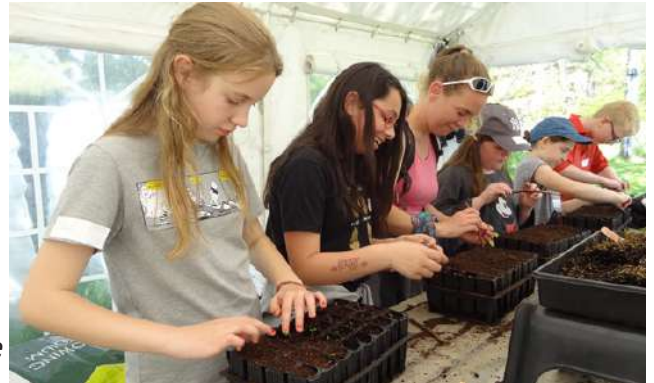
Transplanting rowan tree seedlings into root trainers in the tree nursery.