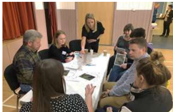
Discussions during Future Fort Augustus Community Design Workshops