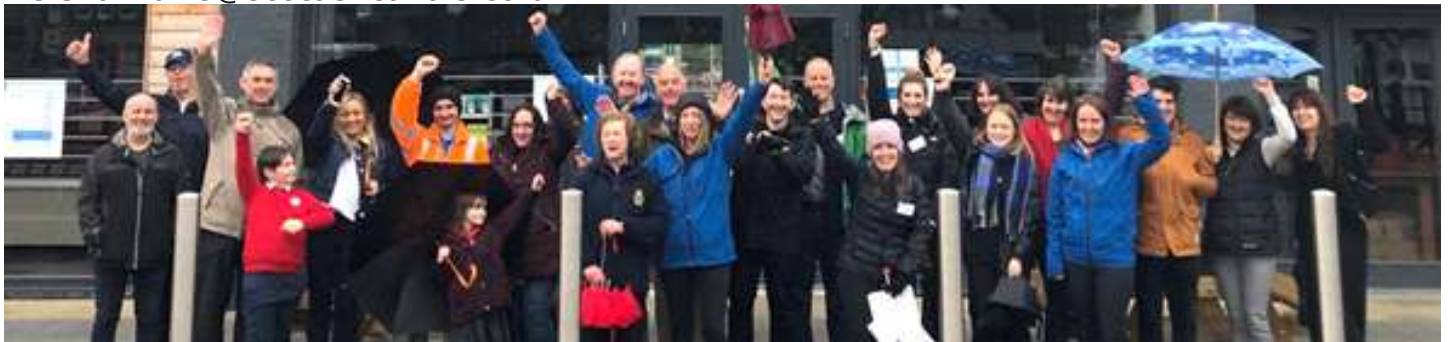
Workshop as part of Future Fort Augustus Community Design Workshops

Please look out for project updates notices which will be advertised around Fort Augustus and if you would like to join our project database please drop a line to: Helena.Huws@scottishcanals.co.uk