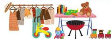
TABLE TOP SALE

TREATS, TRINKETS & TREASURE CLEAR OUT YOUR CLUTTER